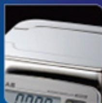
Stainless Steel Tray